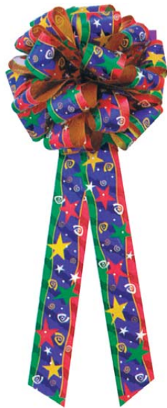
2 1/2" Poly Ribbon $0.95/Yard