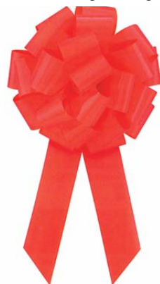
2 1/2" Poly Ribbon $0.50/Yard