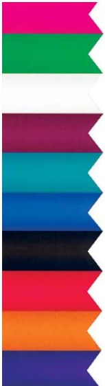
2 1/2" Lacquered Ribbon $0.95/Yard