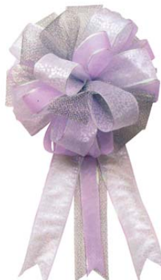
Milori Ribbon/Tulle $1.90/Yard