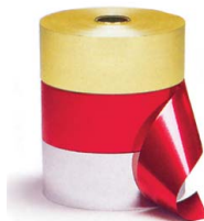
2 1/2" Metallic Ribbon $0.95/Yard