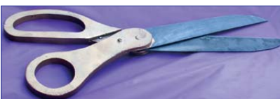
RE-0A101/SI - 8" x 25" Ceremonial Scissors Rent/Day $30.00

CU-R5035/00 - Double Flower - Four Ribbons Plain $5.65 Each Imprinted $7.95/Each